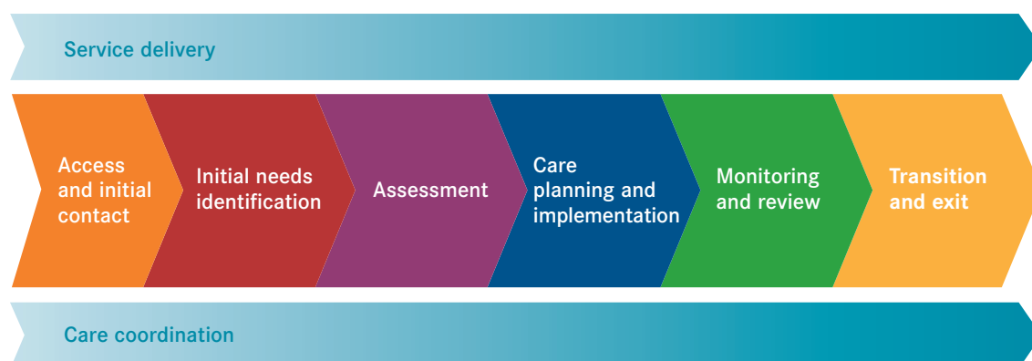
Figure 1: Health independence programs model of care

The health independence programs model of care outlined in the service delivery section of the guidelines is conceptualised in terms derived from the Victorian service coordination practice manual . The health independence programs model of care is illustrated in Figure 1.