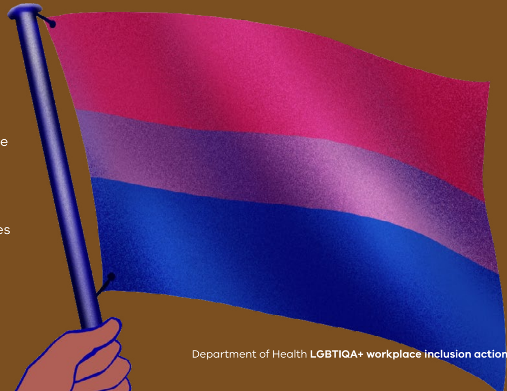
Illustration © 2024 Outright International

Created in 1998 by Michael Page, the bisexual flag features pink and royal blue with an overlapping purple stripe in the center. The pink represents attraction toward the same sex, and the royal blue stands for attraction toward the opposite sex. The purple band symbolizes attraction to all genders.