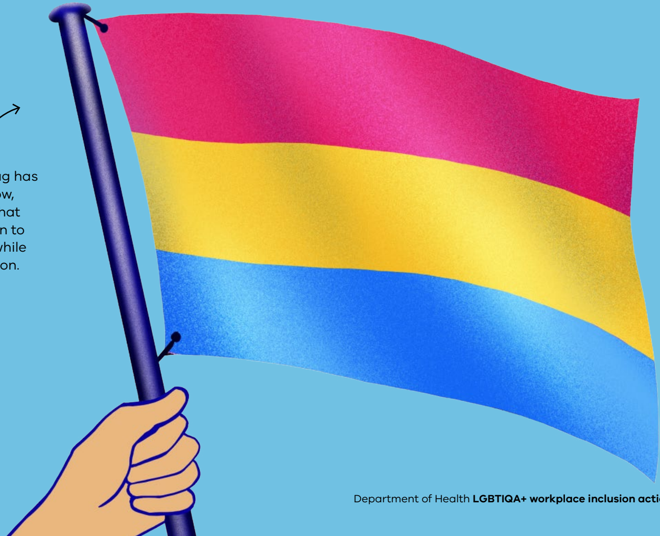
Illustration © 2024 Outright International

Adopted in 2010, the pansexual flag has three horizontal stripes: pink, yellow, and cyan. Most definitions claim that pink and cyan represent attraction to females and males, respectively, while yellow signifies nonbinary attraction.