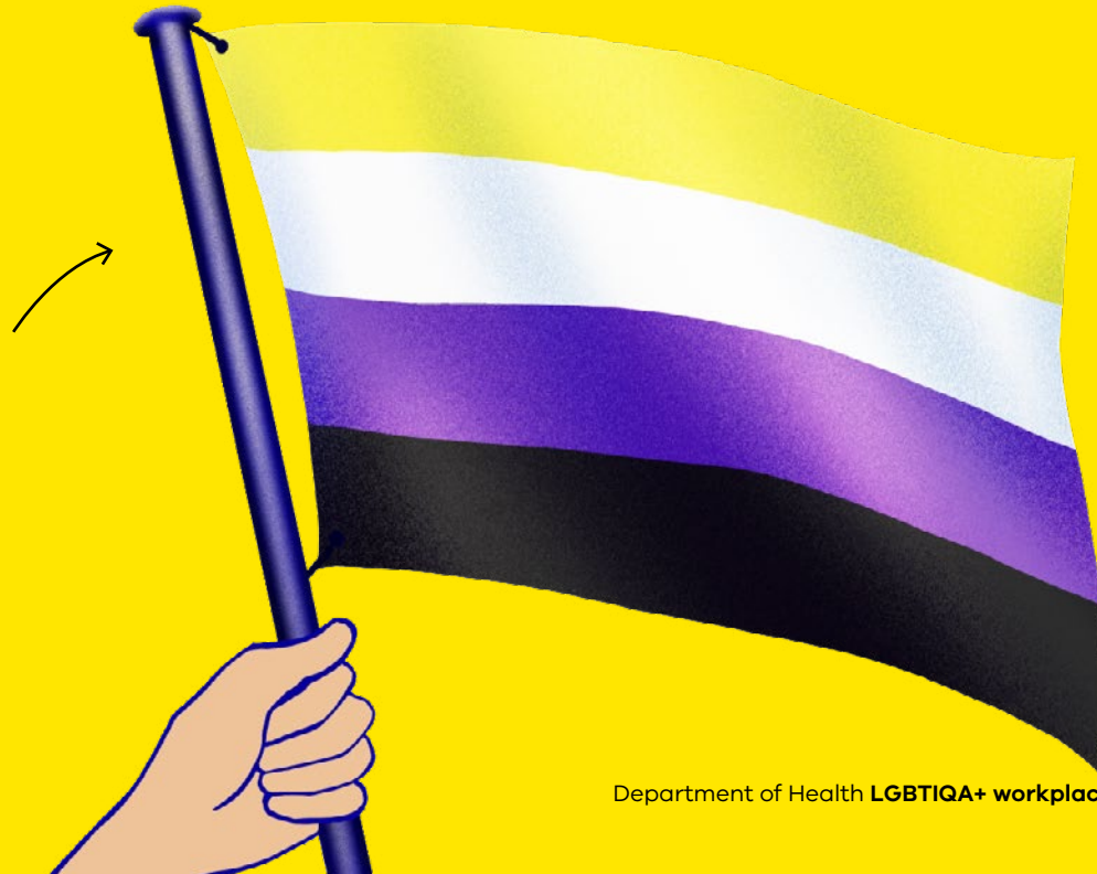
Illustration © 2024 Outright International

With a quartet of horizontal stripes of yellow, white, purple, and black, the nonbinary flag was conceptualized by Kye Rowan in 2014. The yellow stripe represents those whose genders do not exist within the binary. White and purple correspond to people identifying with all or many genders and those who may consider themselves a mix of female and male. Lastly, the black stripe accounts for those who identify as having no gender.