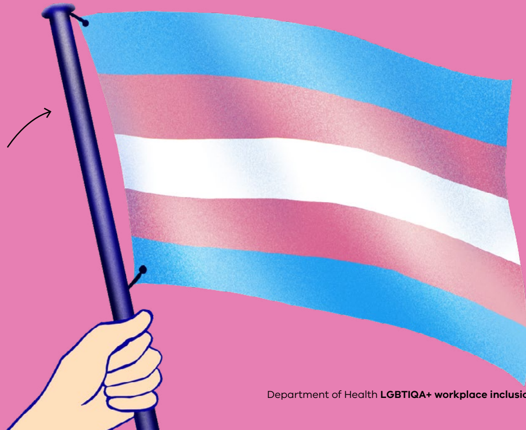
Illustration © 2024 Outright International

Conceived by Monica Helms, an openly transgender American woman, the Trans flag debuted in 1999. The light blue and light pink symbolize the traditional colors for baby girls and baby boys, respectively. Meanwhile, the white hue represents movement members who identify as intersex, gender-neutral, or transitioning. According to Helms, the flag is symmetrical, so “no matter which way you fly it, it is always correct, signifying us finding correctness in our lives.”