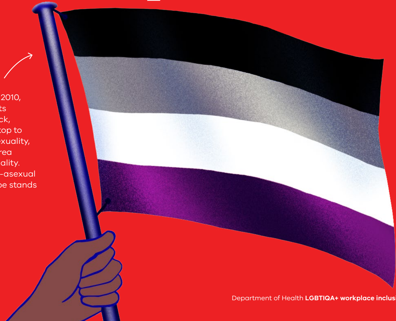
Illustration © 2024 Outright International

First officially used in August 2010, the asexual pride flag consists of four horizontal stripes: black, gray, white, and purple from top to bottom. Black represents asexuality, and gray signifies the gray area between sexuality and asexuality. The white stripe denotes non-asexual partners, and the purple stripe stands for community.