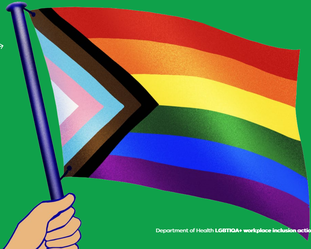
Illustration © 2024 Outright International

Created in 2018 by nonbinary artist Daniel Quasar, the Progress Pride flag is based on the iconic 1978 rainbow flag. With stripes of black and brown to represent marginalized LGBTQ+ people of color and the triad of blue, pink, and white from the trans flag, the design represents diversity and inclusion.